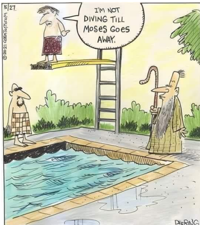
Christian Humour – Facebook