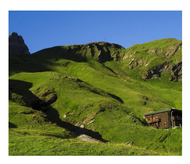
Take refuge in Him